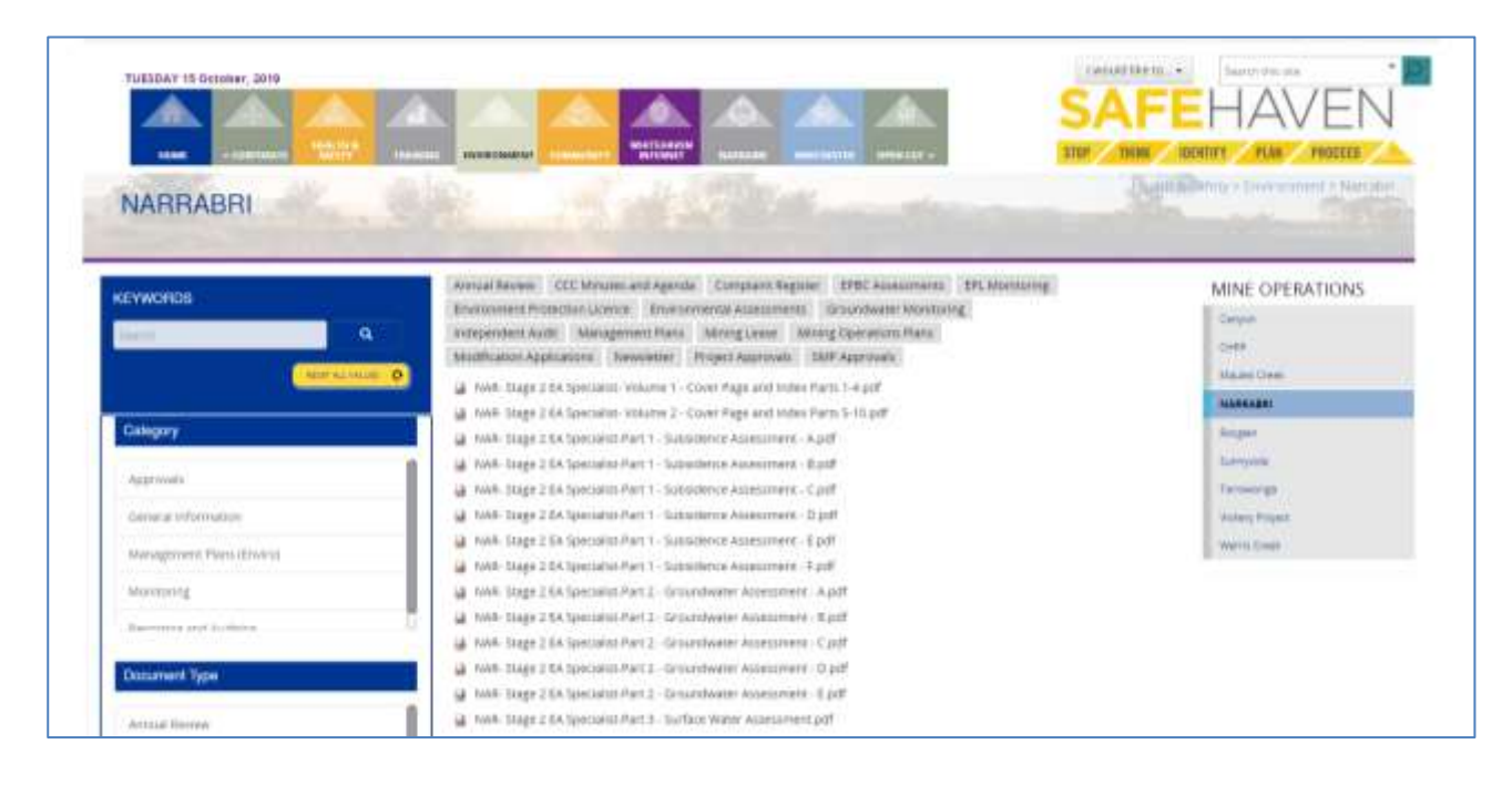
Figure 3: Screenshot of NCO Environmental documents in the Sharepoint online system.